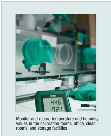
Monitor and record temperature and humidity values in the calibration rooms, office, clean rooms, and storage facilities