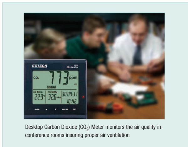
Desktop Carbon Dioxide (CO 2 ) Meter monitors the air quality in conference rooms insuring proper air ventilation